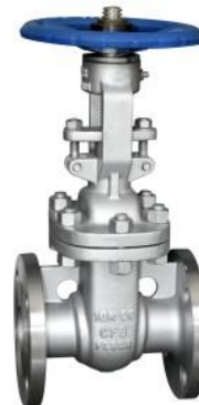
日标闸阀 Japanese standard gate valves