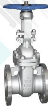
美标闸阀 American standard gate valve