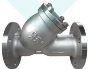
美标过滤器 ANSI Filter