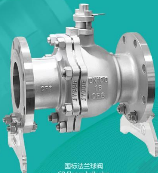
国标法兰球阀 GB Flange ball valve