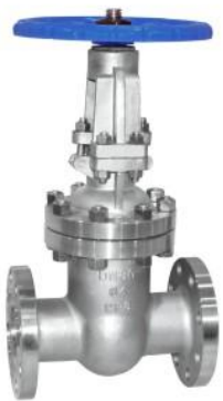
国标闸阀 National standard gate valves