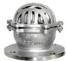
底阀 Bottom valve