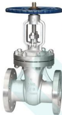
美标闸阀 American standard gate valve