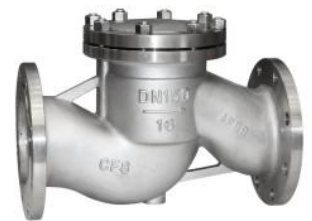
国标升降式止回阀 GB Lift check valve