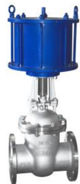
气动闸阀 Pneumatic valve