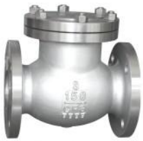
美标止回阀 ANSI Check valve