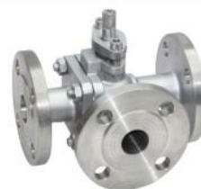
三通球阀 The 3-way ball valve