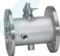
保温球阀 Insulation ball valve