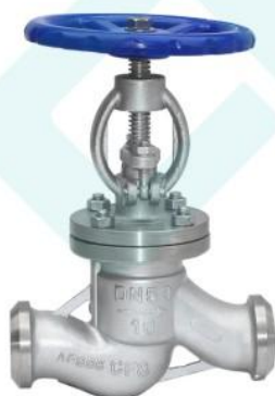
焊接截止阀 Welding stop valve