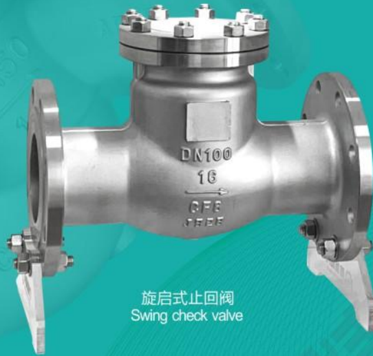
旋启式止回阀 Swing check valve