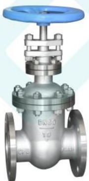
暗杆闸阀 Non-rising stem gate