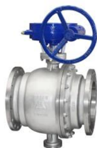
涡轮固定球阀 Turbine fixed ball valve