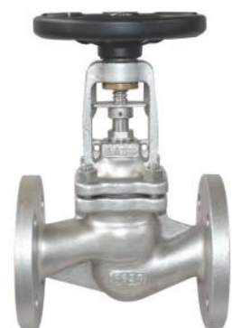
波纹管截止阀 Bellows globe valve