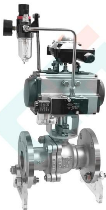
气动法兰球阀 Pneumatic flange ball valve