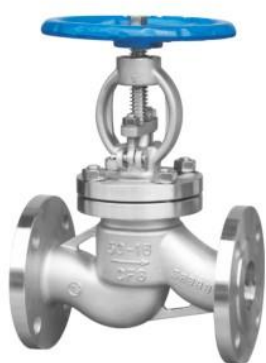
国标截止阀 National standard globe valve