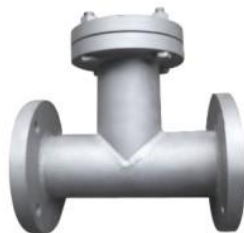
T型过滤器 T Typefilter