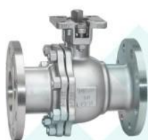
高平台球阀 High platform ball valve