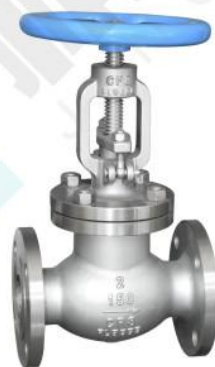
美标截止阀 American standard cut-off valve