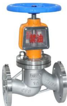
氧气截止阀 The oxygen valve