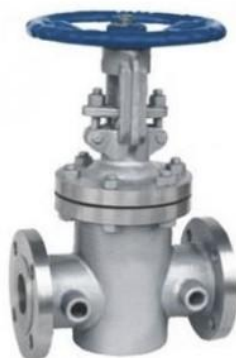
保温闸阀 Insulated gate valves