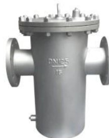
篮式过滤器 Basket strainer