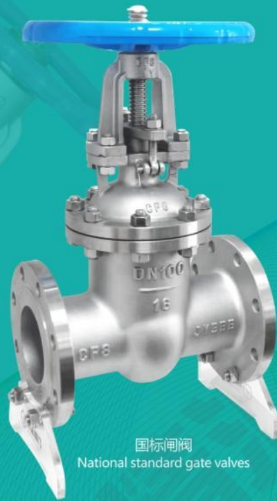
国标闸阀 National standard gate valves