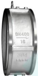
对夹止回阀 Wafer check valve