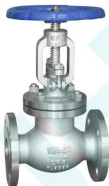
日标截止阀 Japanese standard globe valve