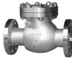
国标旋启式止回阀 GB Swing check valve