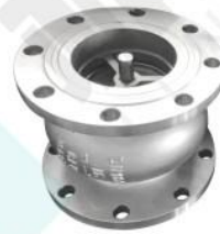
消声止回阀 Silencing check valve