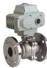
电动球阀 Electric ball valve