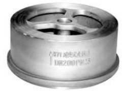
对夹止回阀 Wafer check valve