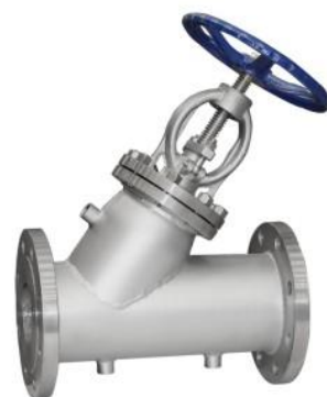
保温截止阀 Insulation cut-off valve