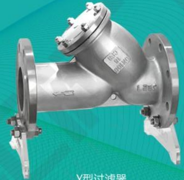
Y型过滤器 Y-type filter