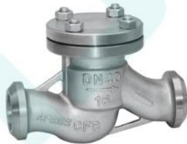
焊接止回阀 Welding check valve