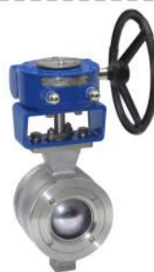
V型球阀 V-shaped ball valve