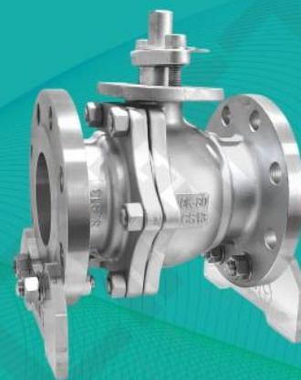
日标法兰球阀 JIS Flange ball valve