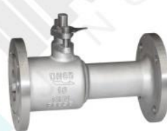
一体式高温球阀 One-piece high temperature ball valve