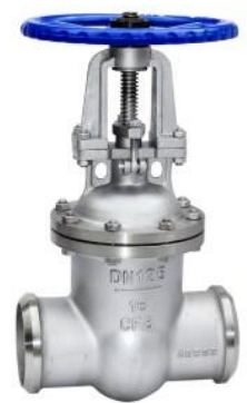
焊接闸阀 Welding gate valves