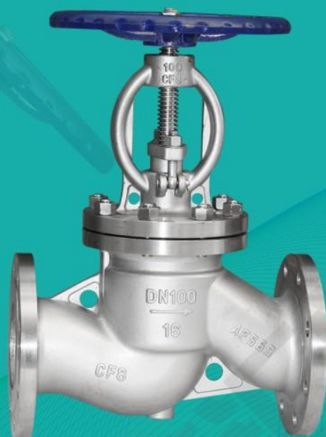
国标截止阀 National standard globe valve