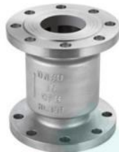
立式止回阀 Vertical check valve