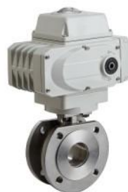
电动薄型球阀 Electric light-weight ball valve