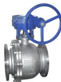
涡轮浮动球阀 Turbine floating ball valve