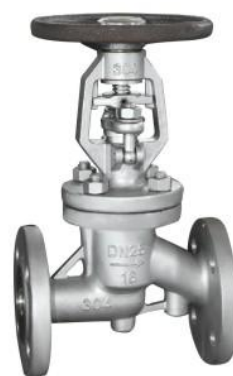
抗生素波纹管截止阀 Antibiotic bellows globe valve